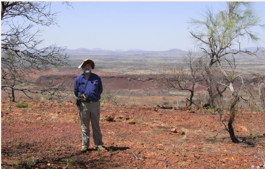
Brockman Project looking south east

During the September 2007 Quarter, Jupiter conducted a field assessment with an iron ore geologist with BHP experience. The drill program is designed to test the grade, lateral extent and thickness of mineralisation at relatively shallow depths.