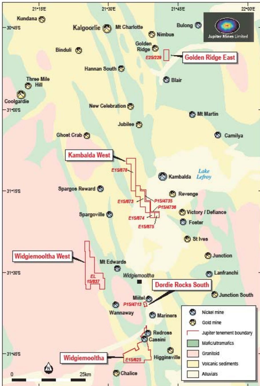
Figure 1: Widgiemooltha Nickel Project