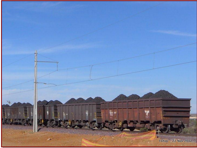
Tshipi Borwa – Rail wagons loaded