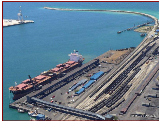
Tshipi Borwa – Vessel being loaded with manganese