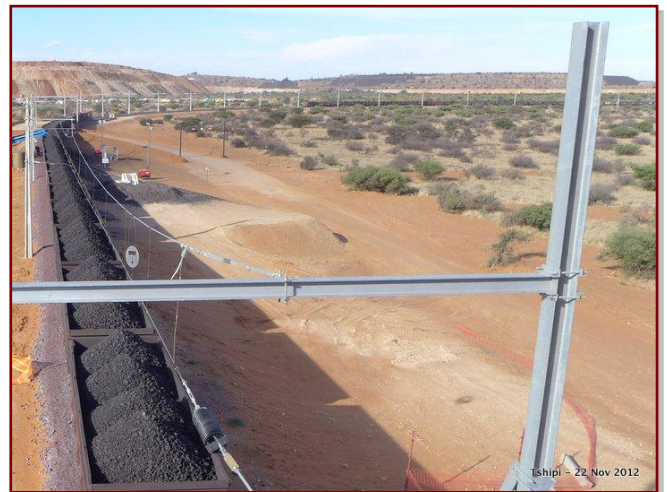
Tshipi Borwa – Rail wagons loaded