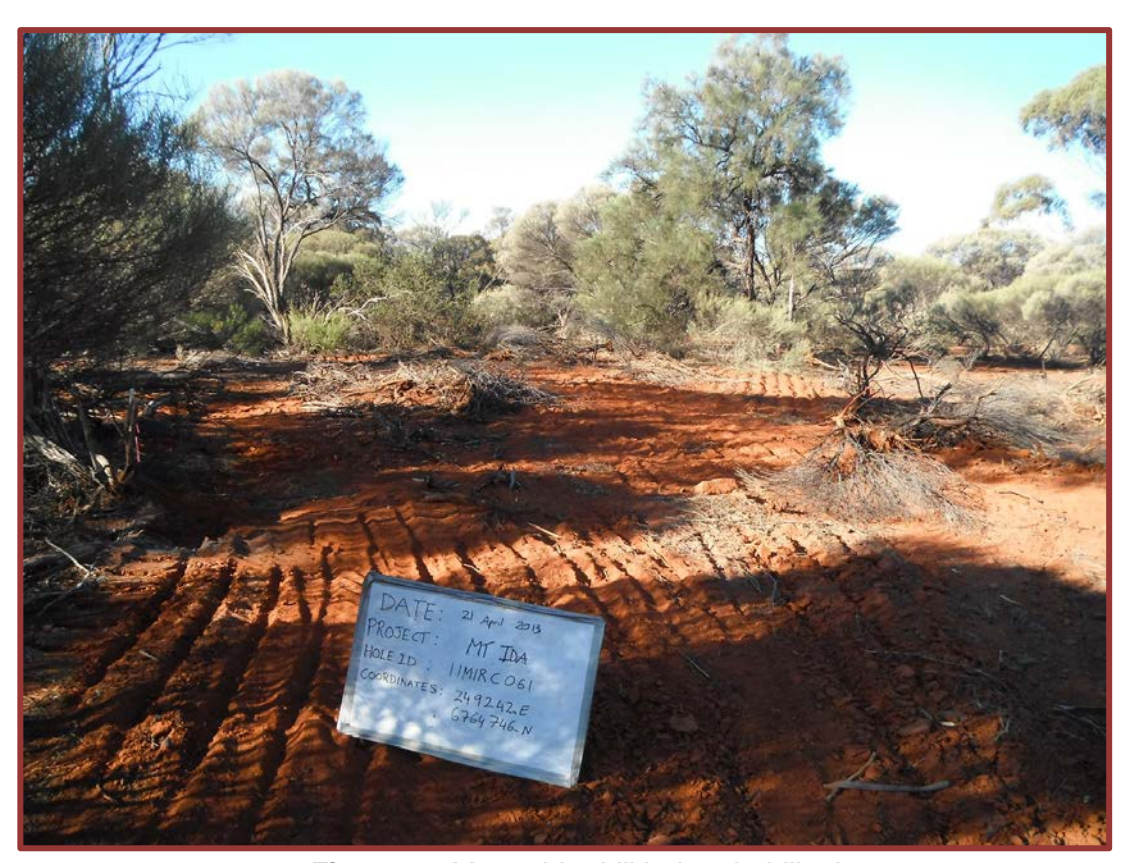
Figure 2 : Mount Ida drill hole rehabilitation