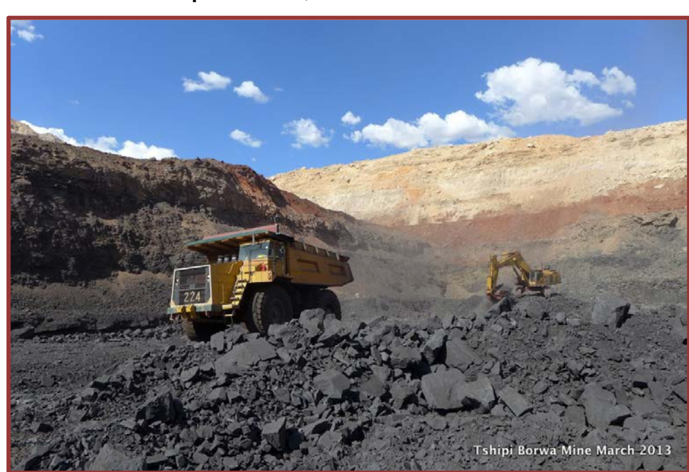
Figure 1 – Tshipi Borwa mine