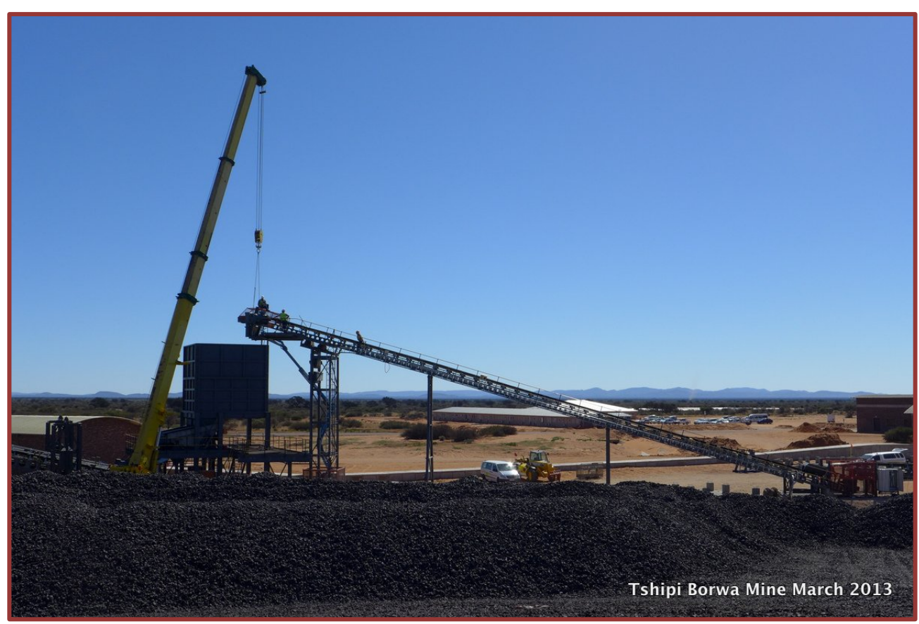
Figure 5 : Tshipi Borwa mine