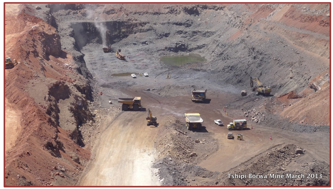
Figure 6 : Tshipi Borwa pit