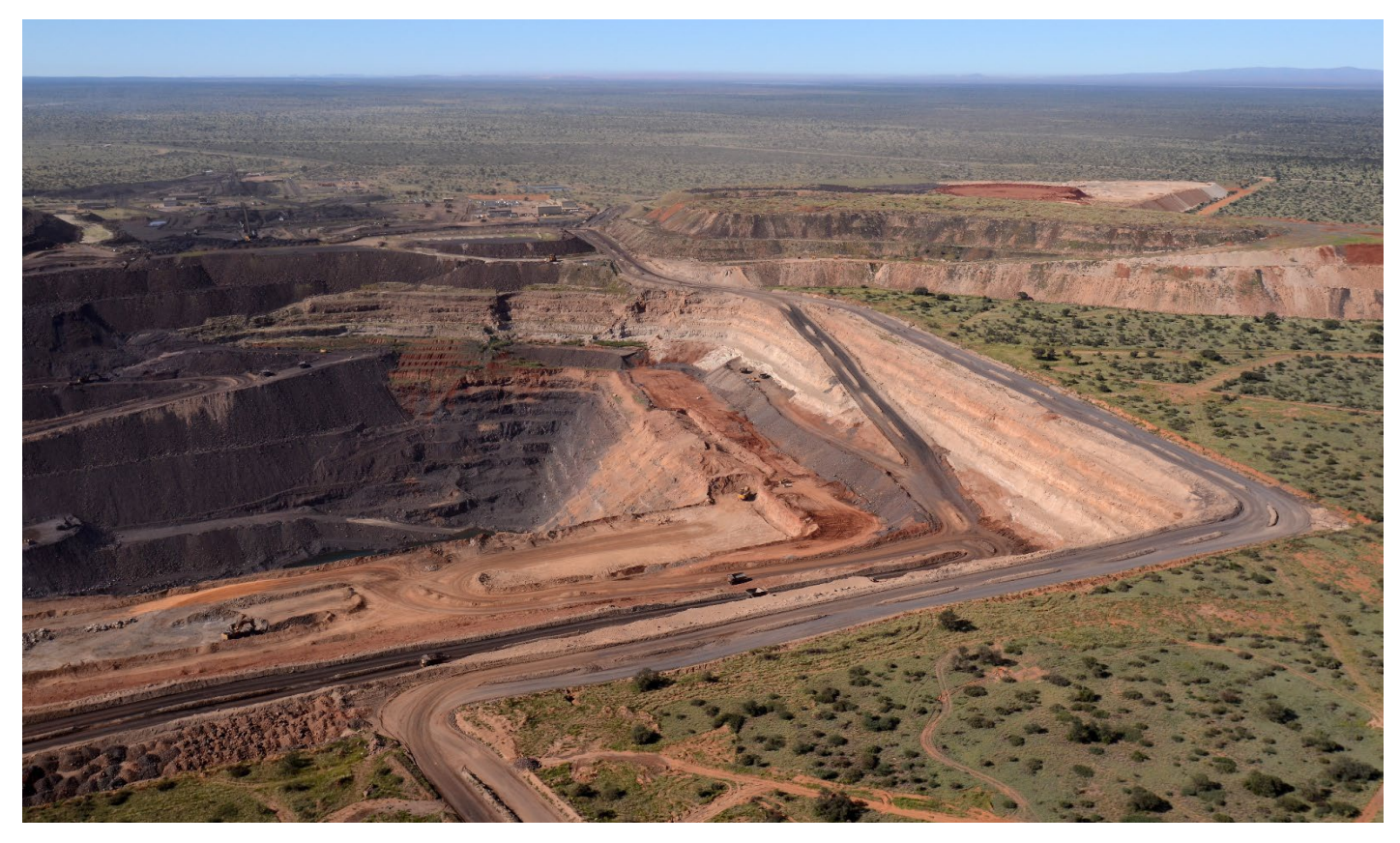
Figure 2: Tshipi Manganese Mine

Mining volumes improved compared to the prior comparative period, and ahead of current year plan, with Tshipi focusing on the depletion of the current cut and exposure of ore in the next cut, prior to the usual rainy season across December to February. Tshipi commenced the financial year with strong first quarter production volumes, which then moderated towards the end of the half-year period. Tshipi ceased production of low grade ore in October 2024 due to market conditions. Significant stockpiles remained at the end of December 2024.